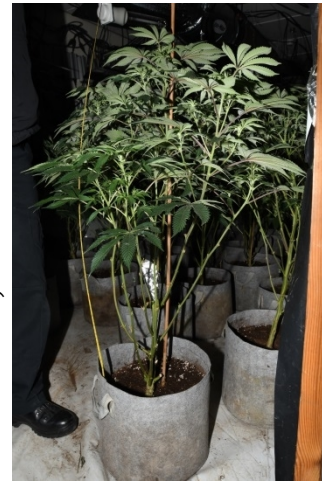
Old Street, Ashton TC

All 3 farms have similar if not the same MO meaning we have disturbed a huge amount of drug related crime!