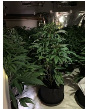
Ellesmere Ave, Hurst